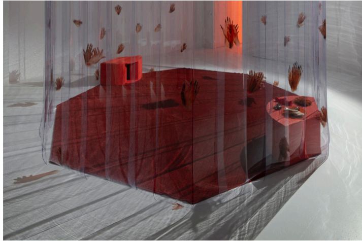
General Partition – Precursor [Vitoria] Arrangement (2024)