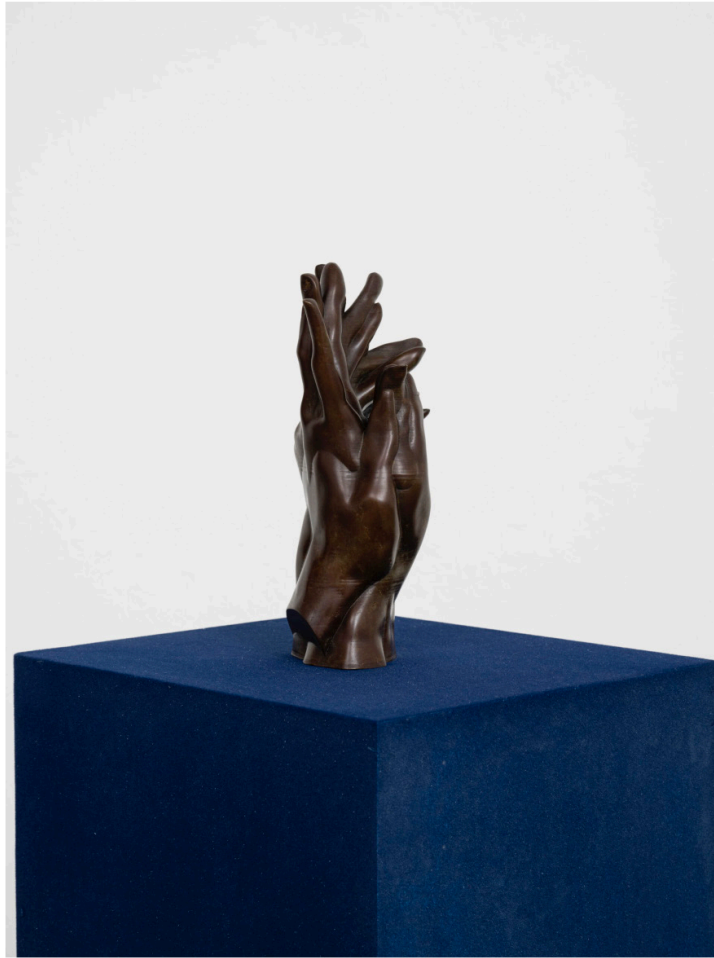
Left Hand of the Sisters (2024)