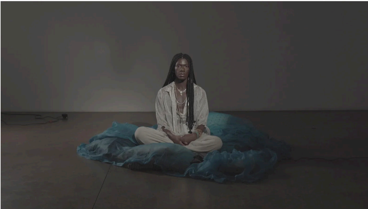
Illustrations for Libatons, Attestations, Affirmations. 2020. Performance, video.

I just started a series of performance works titled my body reminds us of water , that have taken place at different venues around the UK, at small and major institutions: Kings College, Porthmeor Studios in St Ives, Frieze, Camden Arts Center in November. There are a couple more iterations coming up: Oxford in December and at Auto Italia. These performances think through image culture, desire production, the body as an archive, gender as ancestral communication. I've started work on a large scale project called Following The Gourd , which thinks through astronomical knowledge, cosmologies, archival practices, and will have multiple outcomes and realisations. One of these is a web based interactive map of a fictional night sky that also doubles as an archive of trans existence, created with a small group of Black Trans youth, with FACT Liverpool and VISUAL Carlow, in Ireland. I'm also writing a small collection of poetry to come out in 2022.